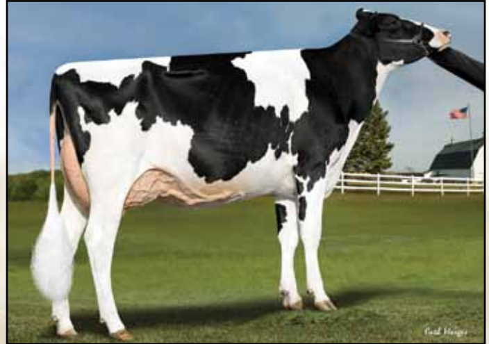
MS Hawkeye Crush Angel-ET VG-88 VVVVE @ 3-01

Arrow's dam is an EX-93 3E Goldwyn from Apple that is the cornerstone of this family with over 40 members selling. Also selling is her fancy Diamondback fall yearling.