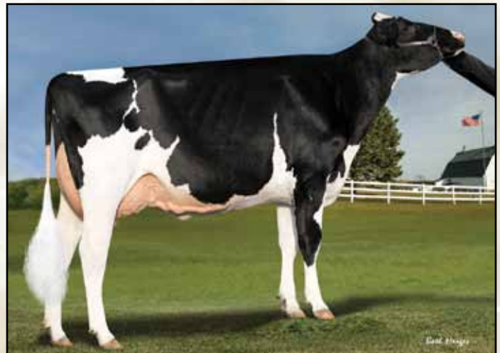
Hawkeye-JK Artic Rain-ET VG-88 VVEVV @ 2-09

Splash was the 2019 Res. Jr. All Iowa Fall Yearling in Milk and is from the EX-91 Defiant and them EX-93 Arizona. She sell due in June to sexed Tadoo and sells with a Sanchez summer yearling.