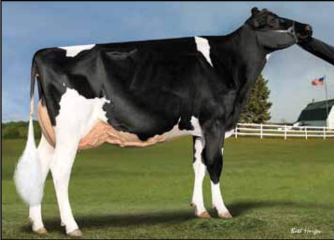
Hawkeye Equation Arrow VG-88 VEVVV @ 3-08