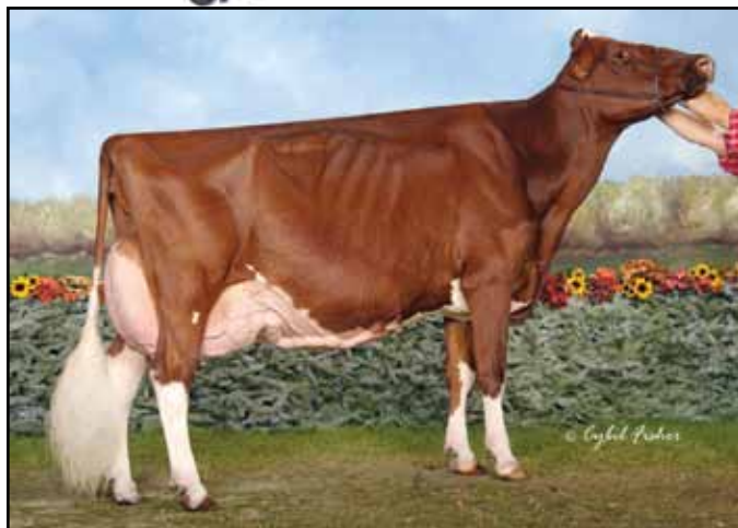
KHW REGIMENT APPLE-RED 3E-96 4-1 2x 365 35,750 4.7 1687 3.7 1314

Best Western Plus Dubuque, Iowa May 5, 2017