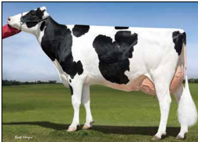
SANDY-VALLEY ROBUST RUBY VG-87 2-4 2x 305 29,450 3.2 950 3.1 916

Her VG-86 Uno sells fresh and along with her 2816 GTPI Jedi born in July and ready to flush. This family has continuous spiked over PA and they like to make embryos!!! Next dam is Gold Invite Ex 94 Nom. All-Canadian followed by a VG 88 Shottle back to Dellia 2E95. Flush age and over 2800 and available doesn't happen very often.