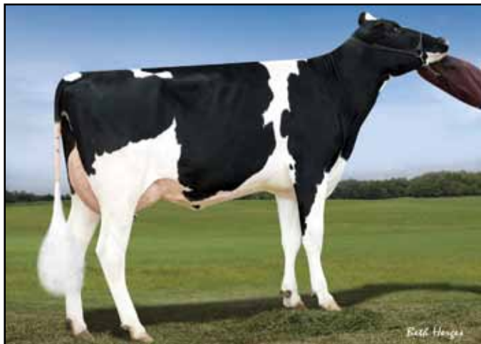
CO-VISTA ROBUST RILEY EX-90 2-1 305 27,530 3.9 1069 3.3 920

Dam of Doorman. Imelda sells open and ready to flush. A favorite among many, she is prolific donor and phenomenal transmitter. One of the easiest cows in the world to mate. Buy the foundation and watch it develop.